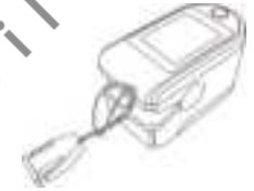
Figure 4. Mounting the hanging rope.