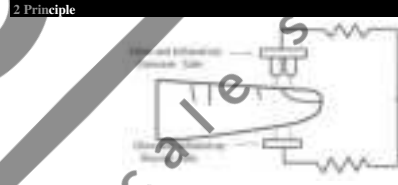
Figure 1 Operating principle

Principle of the Oximeter is as follows: An experience formula of data process is established taking the of Lambert Beer Law according to Spectrum Absorption Characteristics of Reductive Hemoglobin (Hb) and Oxyhemoglobin (HbO 2 ) in glow & near-infrared zones. Operation principle of the device is: Photoelectric Oxyhemoglobin Inspection Technology is adopted in accordance with Capacity Pulse Scanning & Recording Technology, so that two beams of different wavelength of lights can be focused onto human nail tip through perspective clamp finger-type sensor. Then measured signal can be obtained by a photosensitive element, information acquired through which will be shown on screen through treatment in electronic circuits and microprocessor.